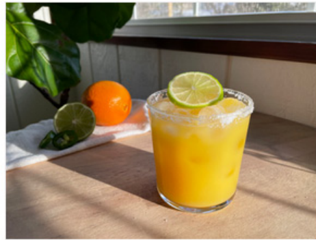
The Classic Non-Alcoholic Margarita