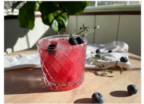
Blueberry Thyme Mocktail