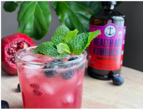
Pomegranate Blueberry Kombucha Mocktail